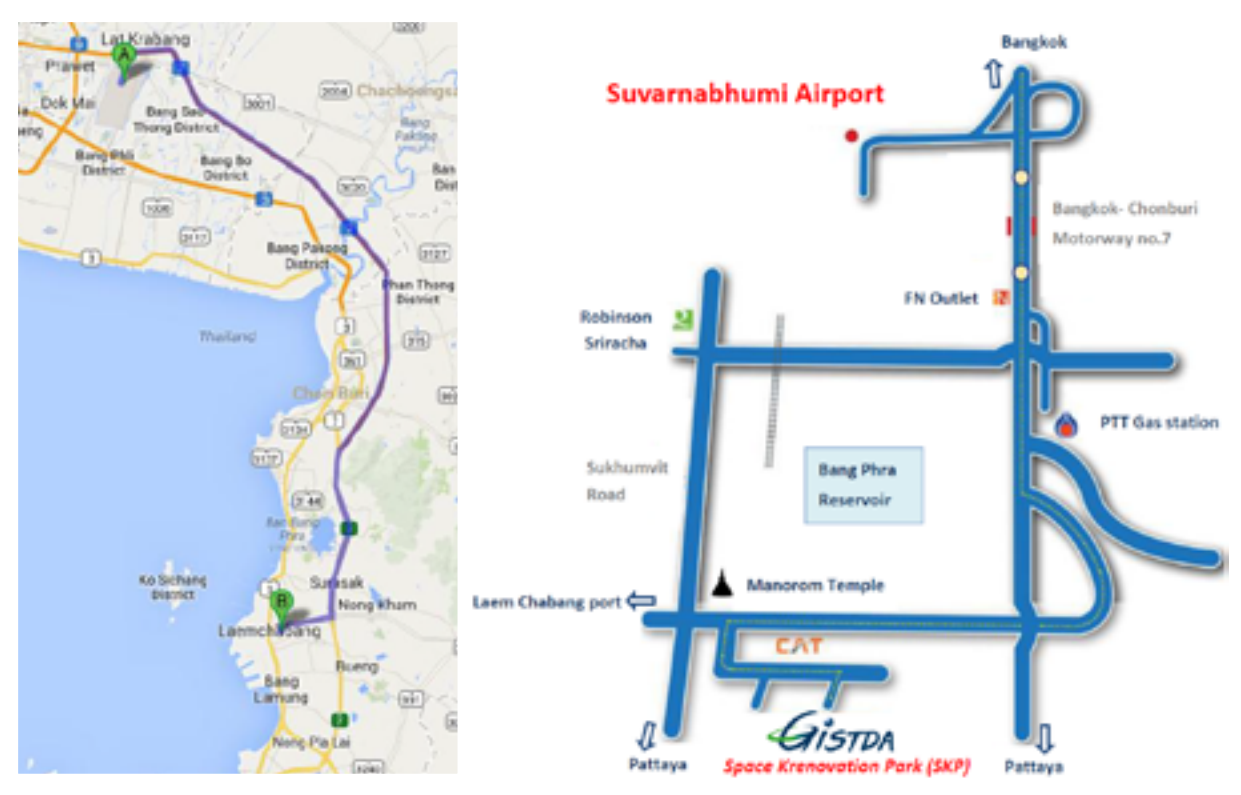
Figure 2 Suvarnabhumi Airport to SKP (Si Racha, Chon Buri province) Distance: 100 km. Duration: 1.5 h.

The venue is approximately 100 kilometers from Suvannaphumi Airport and close to Pattaya, one of the world's most beautiful beaches. The travel time from Suvarnnabhumi Airport is about 1.5 h (see Figure 2).